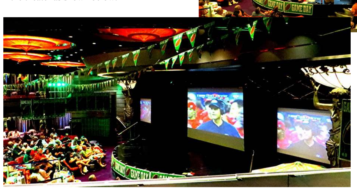
From the cheering of the crowd it appeared that there were slightly more San Francisco 49er fans than those who were for the Baltimore Ravens.

The game started at 1:30pm with the video shown on the three large screens at the front of the theater as shown below.